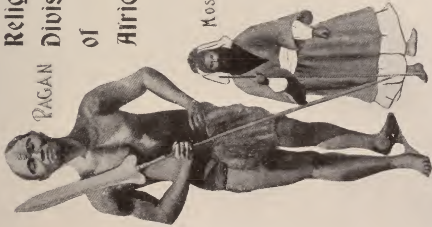
THE RELIGIOUS PROBLEM IN AFRICA

The progress in the Christianization of Africa is thus presented in the Illustrated Missionary News .